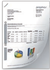
Stapling and Hole Punching