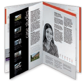
Saddle Stitching and Trimming