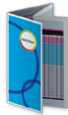
Double parallel Fold